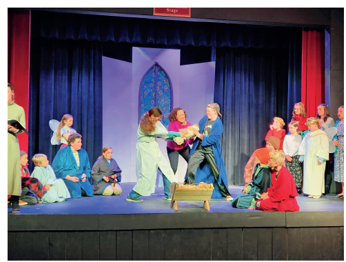
Just some of the chaos

We'll hear who won at the awards ceremony on February 1. Congratulations to all!