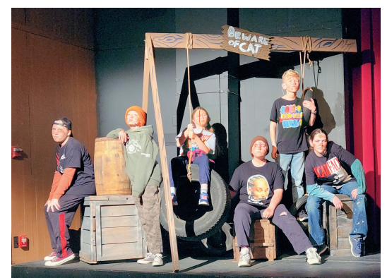
The Herdmans, the worst kids in town