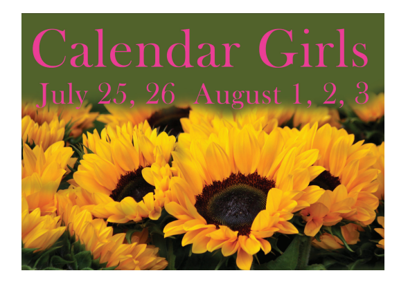
Auditions for Summer Show