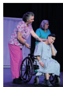
Nurses comfort the patient