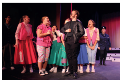
All the girls adore Conrad Birdie