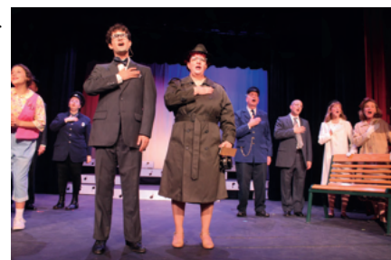
All American Boy