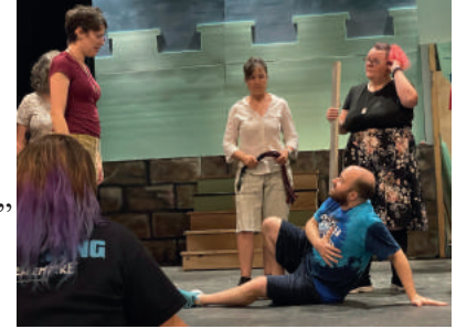
Actors work on stage combat