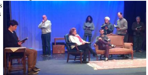
Mousetrap - continued on pg2

Everyone seems to like our process so far. It's collaborative and creative. I am not waiting for the performances I expect, but